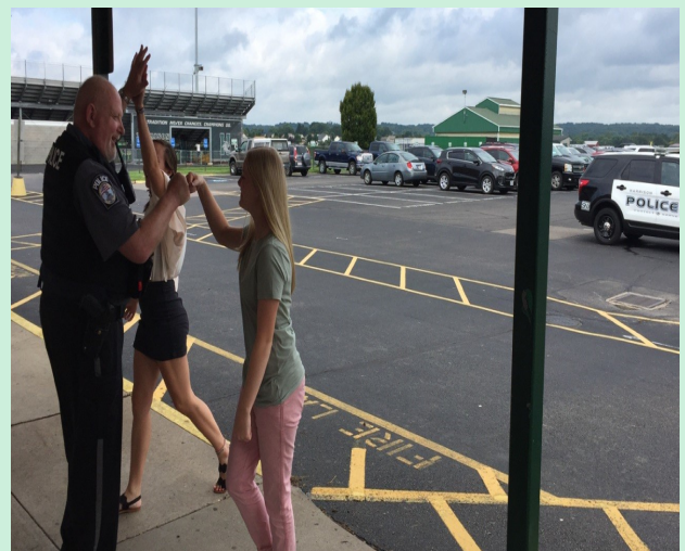
Day 1 with students at both Harrison Junior School (Right) and at Whitewater Valley Elementary (Left)