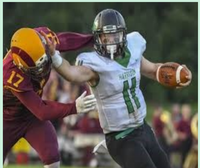
Football is just one of many fall sports whose combined TEAM GPA was over 3.5 for the first quarter this school year!