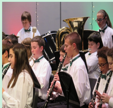
The Fall Drama Production—School of Rock Flier(Left) JS Band Performs at the Activity Center (Right)