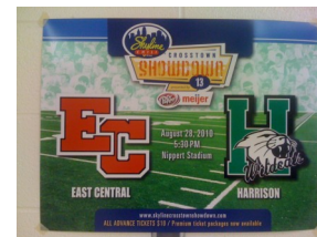
Tickets available at Back's Drive-Through, Village Pharmacy or the High School