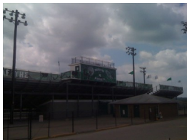
Thank you to the boosters for the updates to our stadium.